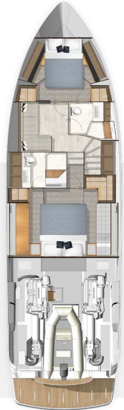
ACCOMMODATION DECK Shown with optional lower lounge design